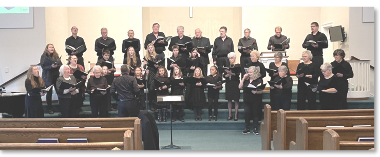
The Intergenerational Choir providing pre-service music

Wondering what's going on in and around Mosaic Conference? See current & past issues of Mosaic News - their weekly e-newsletter - <u>by clicking here</u>.